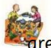
Care and share