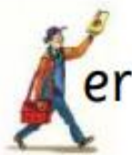
A better letter