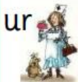
Nurse with a purse