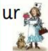
Nurse with a purse