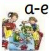
Make a cake