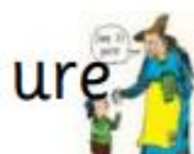
Sure it's pure