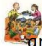
Care and share