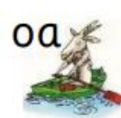
Goat in a boat