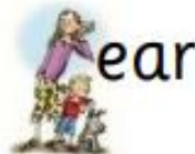
Hear with your ear