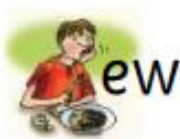
Chew and stew