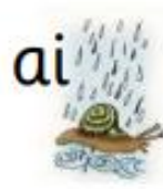
Snail in the rain