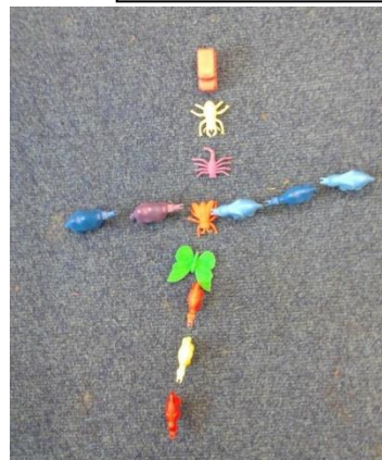
Using found objects to create a cross of thanks for God.