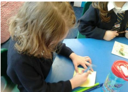
Drawing a picture to show how Jesus is special.

All of our RE work together with the time we spend on teaching our children about Catholic Life, help them progress seamlessly into Year 1 where they continue their spiritual journey.