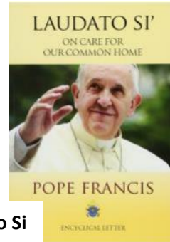
The Laudato Si

Humility- seeing life as gift Compassion - empathy Kindness - working for a fairer world Forgiveness - reconciliation Integrity - do what you say Peace - committed to peace-making, non-violence Courage - standing up for the truth Justice - working for a fairer world