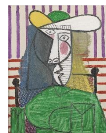
Bust of a Woman 1944 Picasso