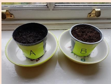
Pots A and B are on the windowsill

We put the same amount of soil into each pot. We then put 3 sunflower seeds into each pot. We watered three of the pots, but left one dry. We then put each pot into a different place in the house.