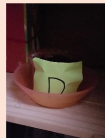
Pot D is in the airing cupboard

Pot A has water, light and warmth. Pot B has light and warmth, but NO water. Pot C has water, but NO light and NO warmth. Pot D has water and warmth, but NO light.