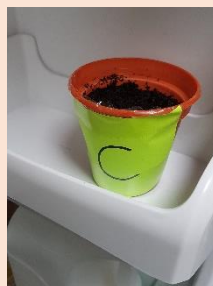
Pot C is in the fridge