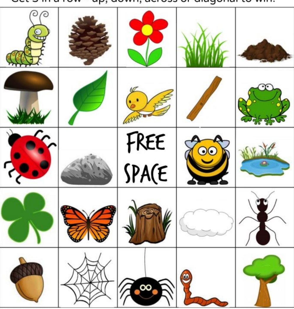
Can you make your own version to play with your family?

Get 5 in a row - up, down, across or diagonal to win!